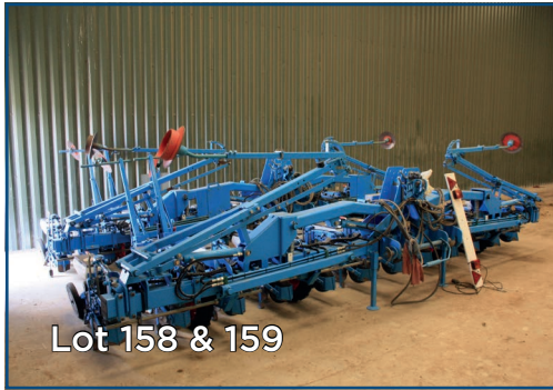
Lot 158 & 159