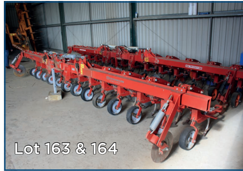
Lot 163 & 164