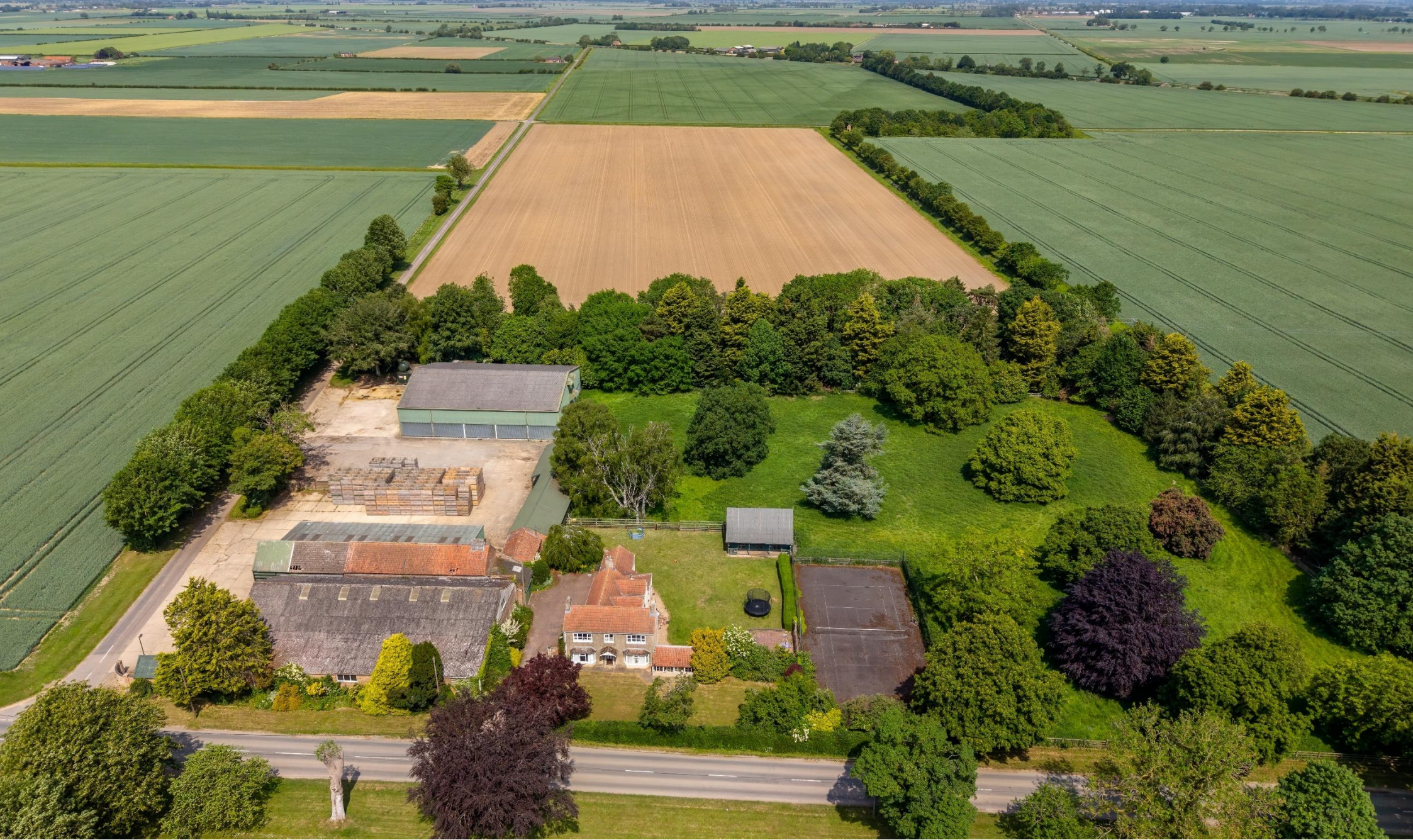
Thornton House Farm, Cannister Lane, Frithville, Boston, Lincolnshire, PE22 7HG